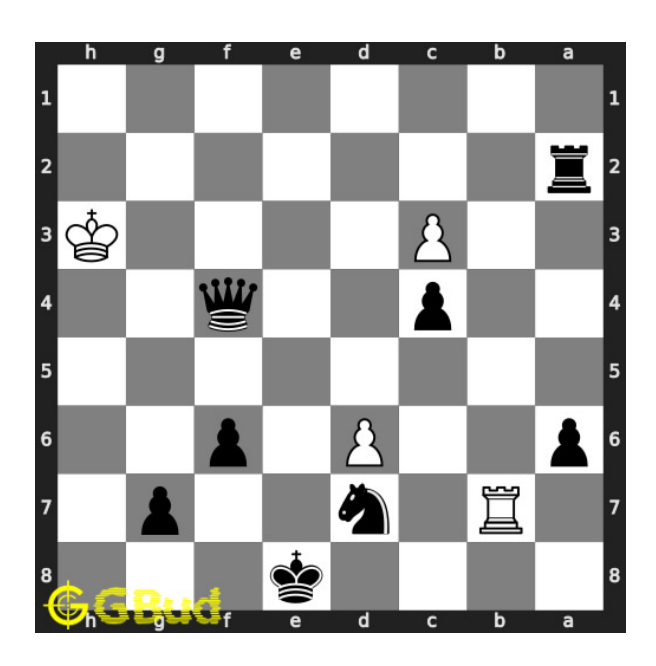
Figure 3: Initial board position of easy chess puzzle 0047

Initial board position This is the initial board position of easy chess puzzle 0047.