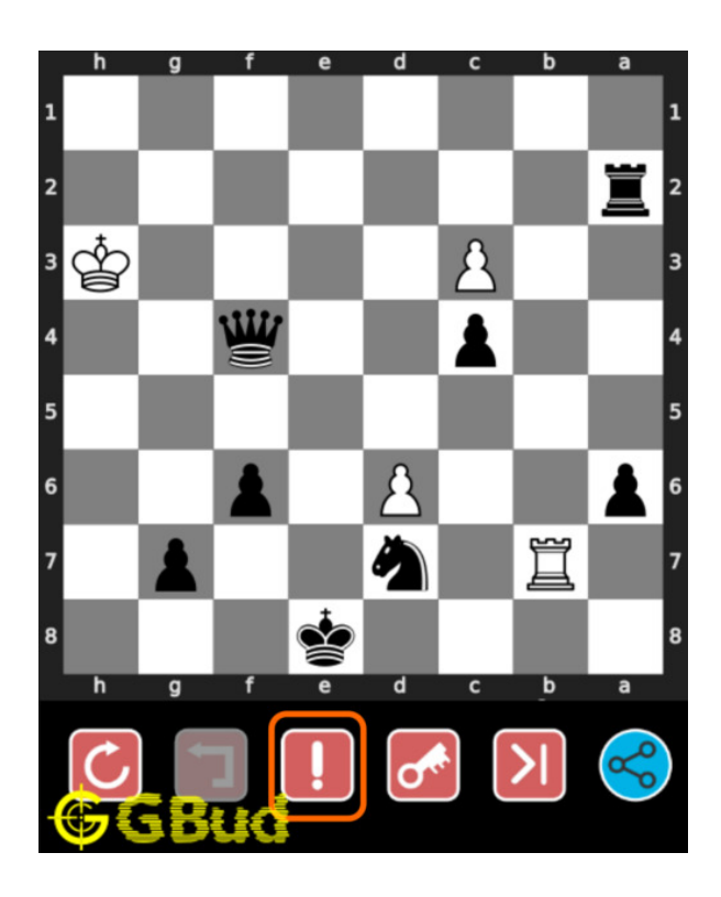
Figure 6: Click the help button to get help on next move @ https://gbud. in/gpq1b81