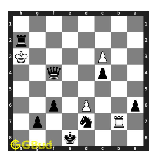
Figure 4: Rh2# - King has no free squares to move as your queen is nearby. This is called kill box mate